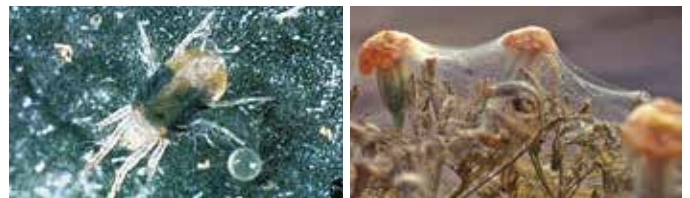
Spider mite adult female and egg