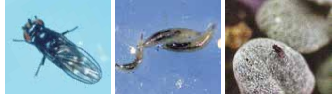
Shore fly adult