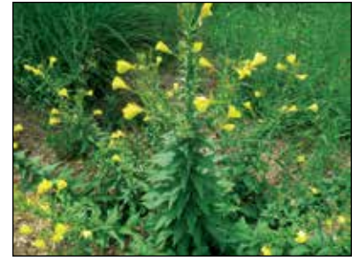
Evening Primrose, Common