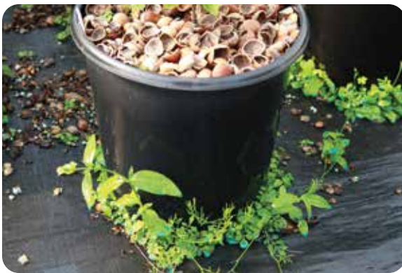
Before: FireWorxx sprayed with adjuvant

Use 1% rate to improve efficacy of other herbicides including glyphosate; glufosinate can be used to improve control of glyphosate-resistant weeds. Observe all the precautions on all tank mix partner labels.