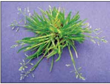
Annual Bluegrass, poa