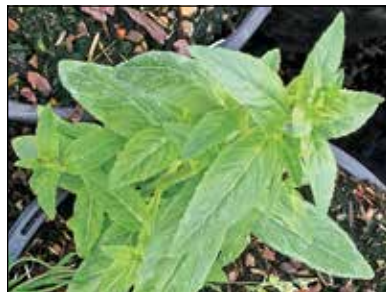
Northern Willow Herb