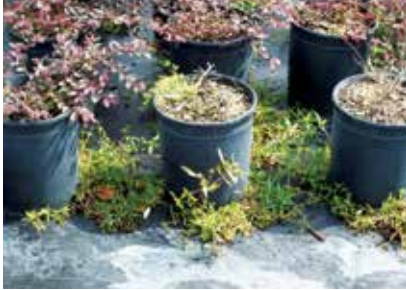
Container ornamentals in outside production areas. Weeds either in the container or on the base ground cloth or gravel bed.