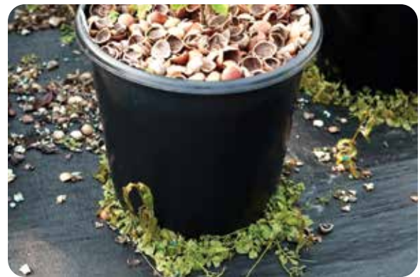
After: FireWorxx showing burn down one hour after application.