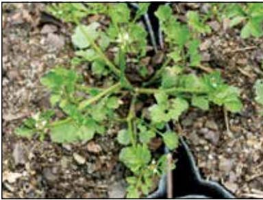
Bittercress (Cardamine spp)