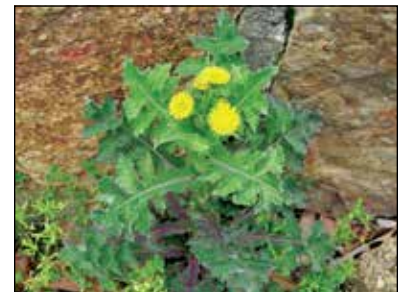
Sow Thistle, annual