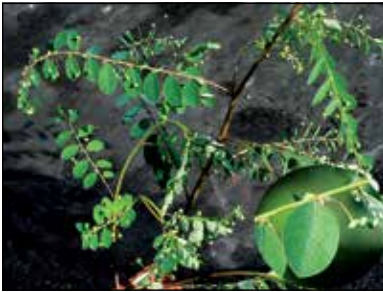
Long Stalked Phyllanthus