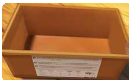
OHP calibration pan with directions for use sticker