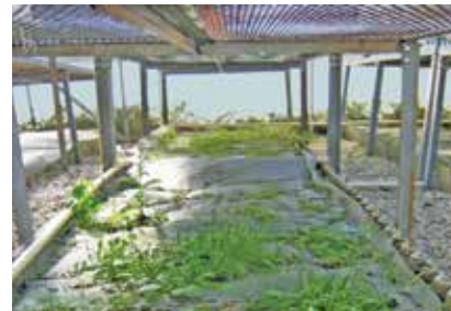
Weeds under benches in greenhouses, hoophouses or shade houses. These are prime harborage sites for insects such as thrips, fungus gnats and others.