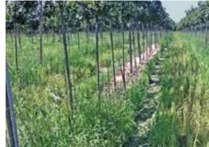
Weeds in field grown ornamentals or shrubs. Weeds not only compete for water and nutrients but also harbor mice and other pests capable of damaging the plants.