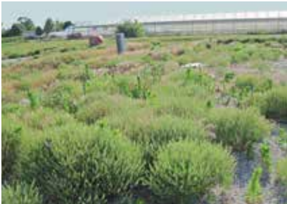
Growing blocks and pads. Weeds are often found in rock pads or weed cloth areas. Cracks in the soil or tears in the cloth provide opportunities for weed development.