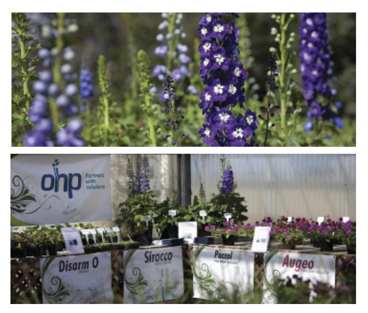
Top photo, part of the outdoor display at American Takii in Salinas during the California Spring Trials. Bottom, OHP's demonstration area during the Trials.

Disarm is a registered trademark of Arysta LifeScience North America, LLC.