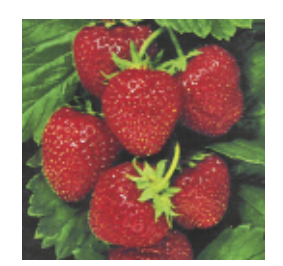
Veranda O is labeled for use on strawberries and carries a 0 hour Post Harvest Interval (PHI).

Veranda O should be used preventatively; that is, when conditions are ripe for disease development. Rates are 4 to 8 oz. per 100 gal. Spray residue is minimal.