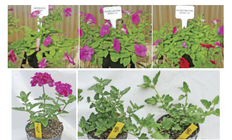
Top photo, Cadenza Petunia at 6 WAT, check on left, Augeo at 400 PPM in center, and 800 PPM on right. Lantana (below) untreated check on left, 400 PPM in center, and 800 PPM on right. The lantana were treated in the plug stage while the petunias were sprayed after transplant.

For more information on Augeo or how to use it, visit ohp.com or consult with your OHP regional sales manager.